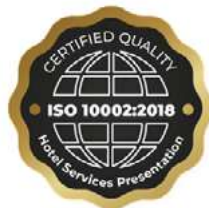
ISO 10002:2018 Customer Satisfaction Management System