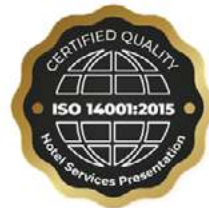
ISO 14001:2015 Environmental Management System