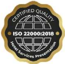
ISO 22000:2018 Food Safety Management System