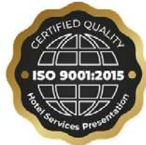
ISO 9001:2015 Quality Management System