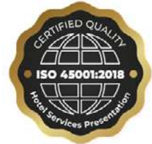
ISO 45001:2018 Occupational Health and Safety Management System