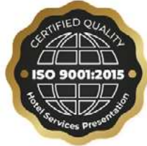
ISO 9001:2015 Quality Management System