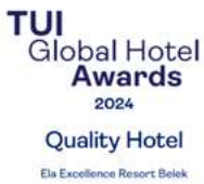
TUI GLOBAL HOTEL AWARDS QUALITY HOTEL 2024