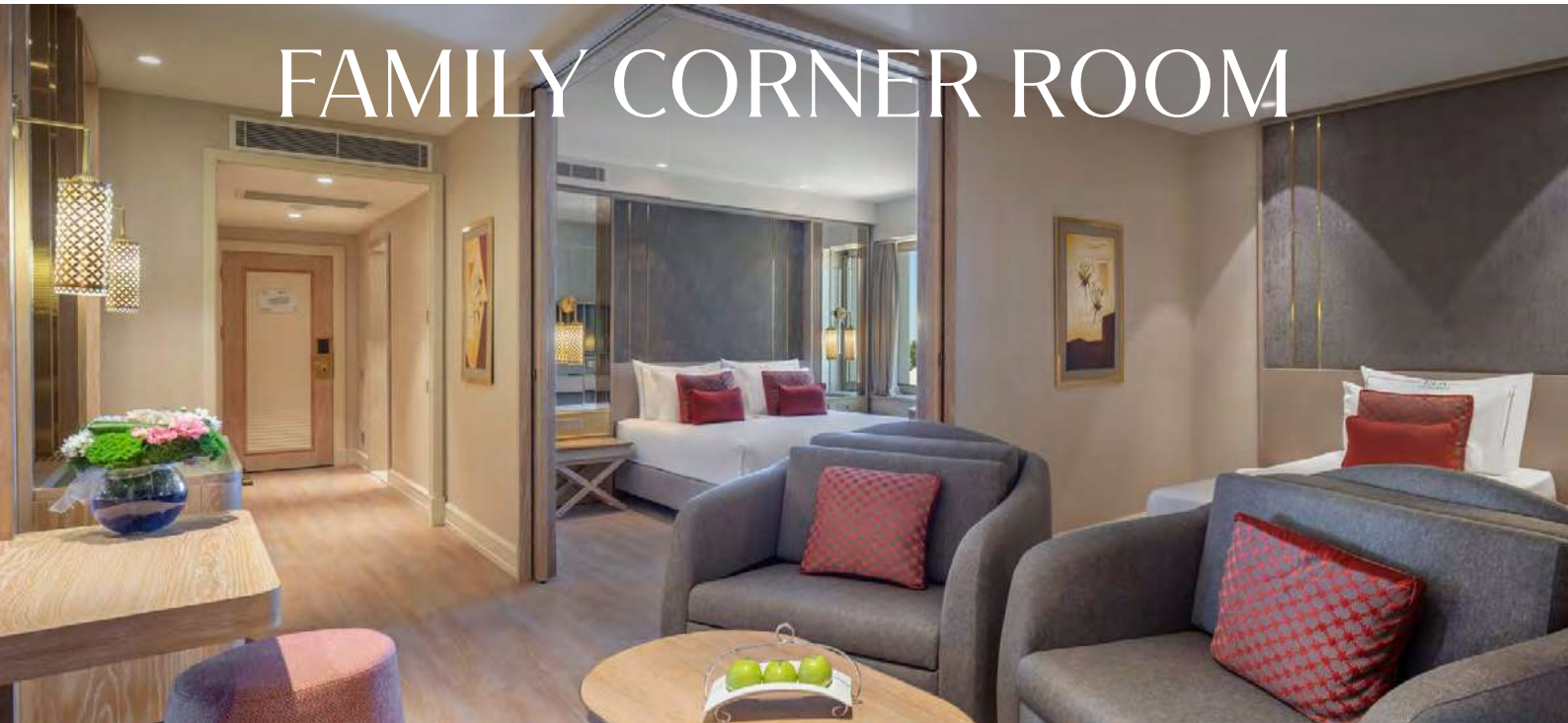
Main Building | 45 m 2 | 2 Adults + 2 Children or 3 Adults

These rooms are organized according to the needs of parents and children, you can feel comfort that makes every moment unforgettable.