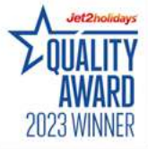
JET2HOLIDAYS QUALITY AWARD 2023