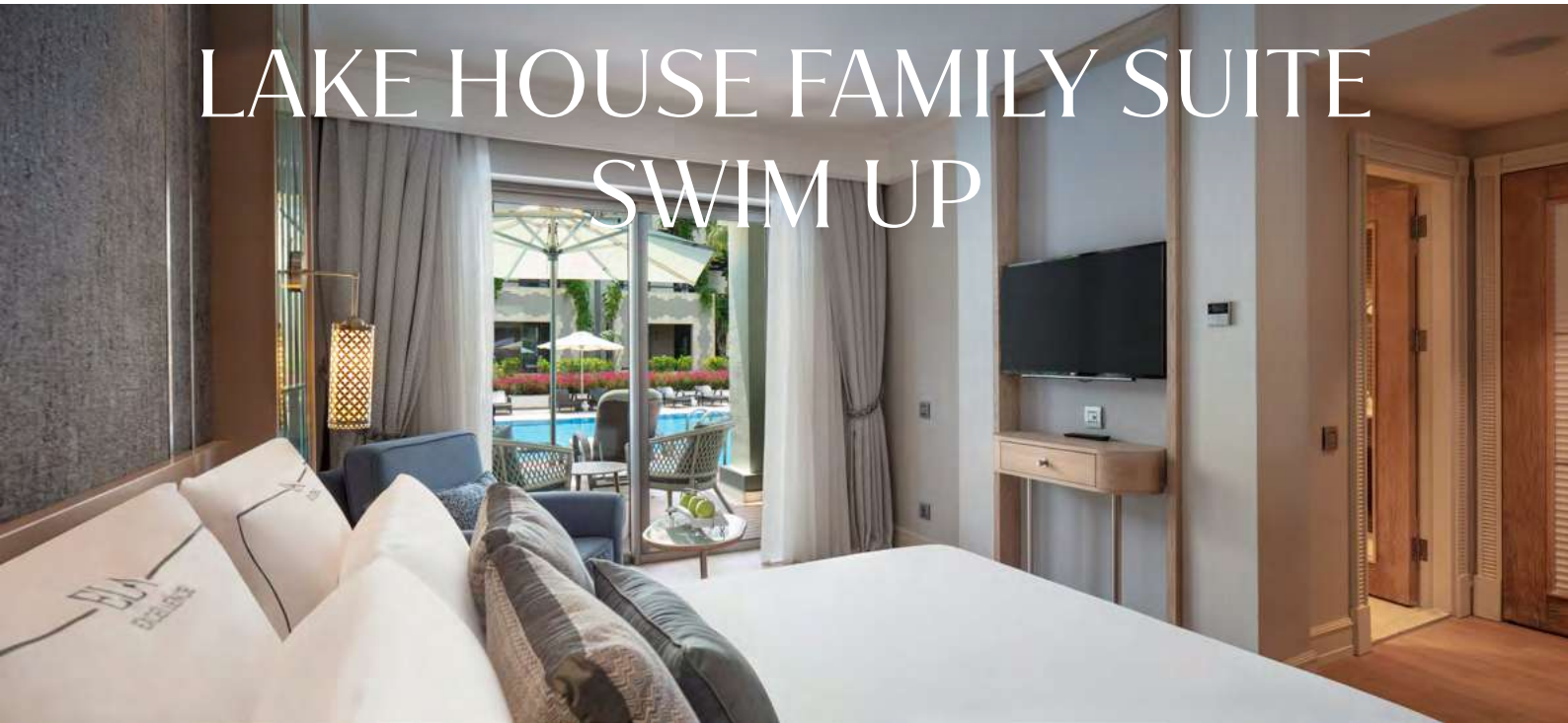
Lake House | 76 m 2 | 4 Adults + 1 Child

When you close your eyes and take a deep breath, you will realize that this moment is exactly the vacation experience you have been dreaming of.