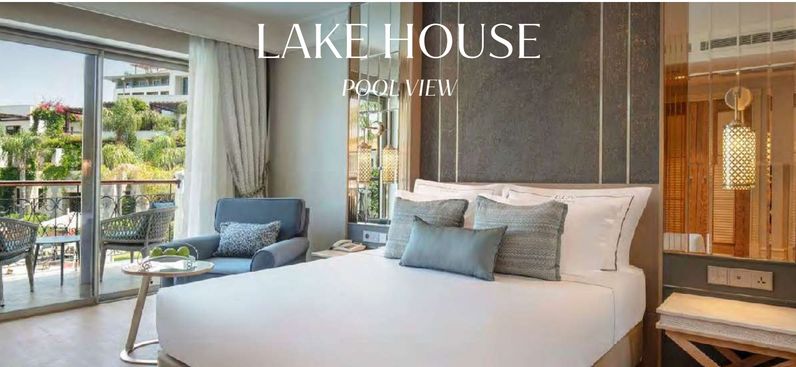
Lake House | 38 m 2 | 2 Adults + 1 Child

Enjoy a luxurious vacation in touch with nature in the Lake House Pool View room, which crowns every shade of green with Ela's elegant and charming touch.