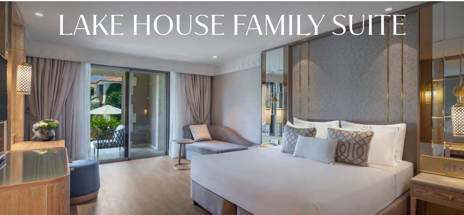
Lake House | 100 m 2 | 4 Adults + 1 Child

With spacious living areas and charming views, these suites offer the ideal setting for a relaxing family vacation.