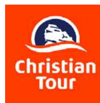
CHRISTIAN TOUR - BEST ACCOMMODATION AWARD 2022