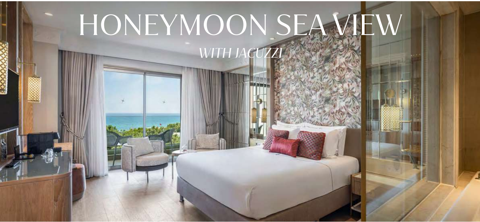
Main Building | 48 m 2 | 2 Adults + 1 Child

You will feel the calm of nature at every moment while experiencing your romantic moments in a fascinating atmosphere.