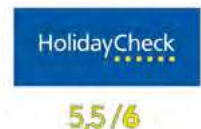
HOLIDAYCHECK 5.5/6 2021

Ela Excellence Resort Belek may terminate or suspend A La Carte restaurants, similar services, and venues for certain periods due to insufficient guest demands, such as unsuitable weather conditions, or similar operational reasons. Ela Excellence Resort Belek has the right to make unilateral changes matching with the concept without informing the second and third persons/institutions.