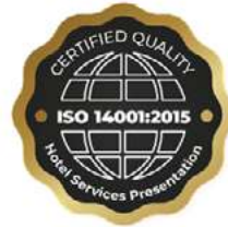
ISO 14001:2015 Environmental Management System