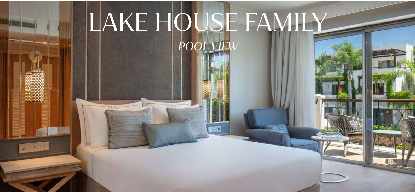
Lake House | 76 m 2 | 4 Adults + 1 Child

It is one of the most ideal room designs where you can enjoy the pool with your family after a walk in a lush nature. The Lake House family room offers an unforgettable vacation experience with your family inside the charming beauty of nature. Consisting of two separate bedrooms connected, these large and spacious rooms are designed for the comfort of families in every detail. You can feel the tranquility of nature through the balcony overlooking the lake.