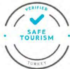
Safe Tourism Certificate