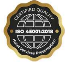
ISO 45001:2018 Occupational Health and Safety Management System