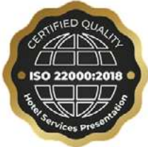
ISO 22000:2018 Food Safety Management System