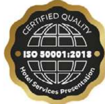
ISO 50001:2018 Energy Management System