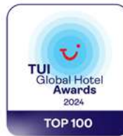
TOP 100 HOTELS AWARD 2024